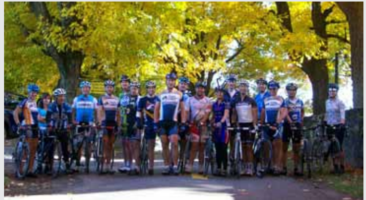
Peaks Fall Power Camp

The total camp fee minus $150 is refundable for withdrawals up until February 5th, 2011. For withdrawals after Feb 5th, 2011 but on or before March 18th 2011, 50% of your full camp fee payment is refundable. For withdrawals on or after March 18th, 2011 no refund will be made available.